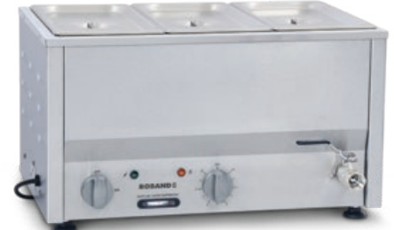
BM2B (wide footprint)