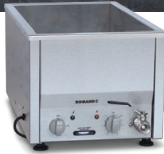
BM21 (narrow footprint)