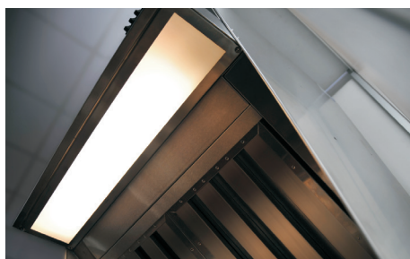
Includes fluorescent lighting