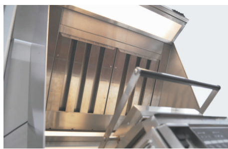
Designed for use over benchtop equipment