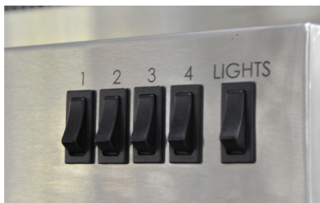
Multiple speed fan selection

Bench mounted for use in new or existing premises