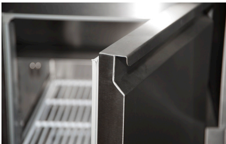
Fridge doors with easy to clean handles