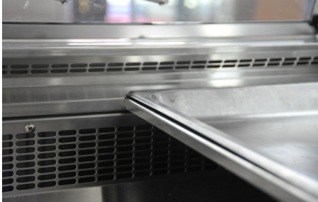
Cool air is blown above and below the produce

The Woodson sandwich preparation fridge combines a refrigerated ingredient well, display and under-counter storage with a preparation area to the rear.