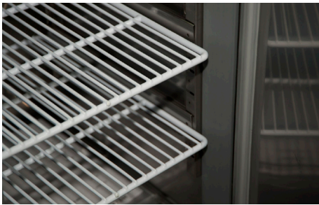
Under-bench shelving racks